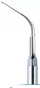
100 Universal UE100

Probe-sized tip used to remove light deposits in shallow to moderate pockets and for periodontal maintenance.