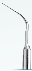
100 Universal US100

Probe-sized tip used to remove light deposits in shallow to moderate pockets and for periodontal maintenance.