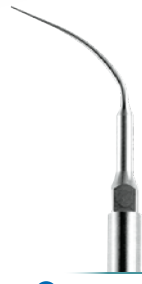
P Universal UEP

Standard diameter tip used to remove moderate to heavy deposits located supragingivally and in shallow pockets.